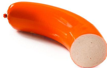
No.23 Fleischwurst – delicious seasonal fine pork sausage (cal. 45mm)