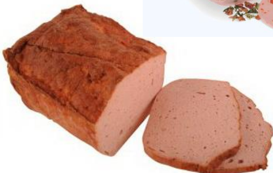
No.25 Meat Loaf – mildly spiced fine pork emulsion, crispy oven roasted