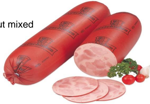
No.21 Bierschinken – delicious cold cut mixed with seasoned pork ham cubes (cal. 80mm)