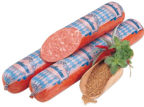
No.20 Cooked Salami – Beef and pork blended with aromatic spices (cal. 45mm)