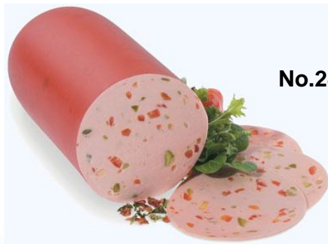
No.24 Chili Bologna – spicy Bologna with fresh whole red and green chili peppers (cal. 80mm)