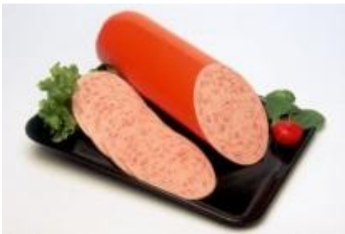
No.22 Hunting – ground pork bologna with aromatic herbs