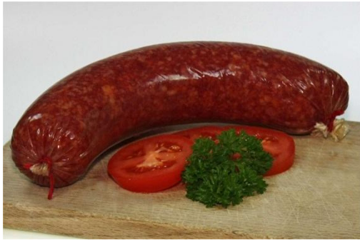
No.45 Mettwurst – spreadable sausage with crushed black pepper, mild cold smoked