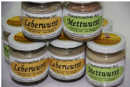
No.47 Home Made Glass – two different kind of glass: pork liver pate or Breakfast meat

→ extra long shelf life without refrigeration