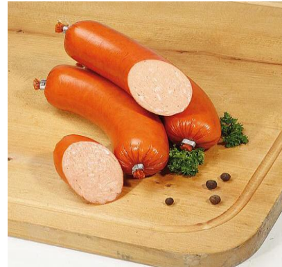
No.46 Teewurst – extra spreadable sausage made of finely minced pork, cold smoked